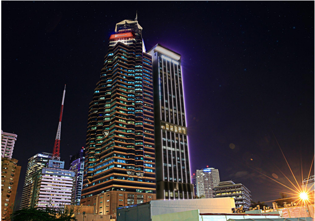
UnionBank Plaza in Pasig.

There will also be investments for improving the efficiency and reliability of existing baseload plants critical in powering the country's economic progress, as well as for various land acquisitions, new substations, and new meters for its distribution business. As it aspires to grow beyond its core business of electricity generation and distribution, AboitizPower is also exploring new energy-adjacent opportunities, from energy storage systems to the Internet of Things (IoT).