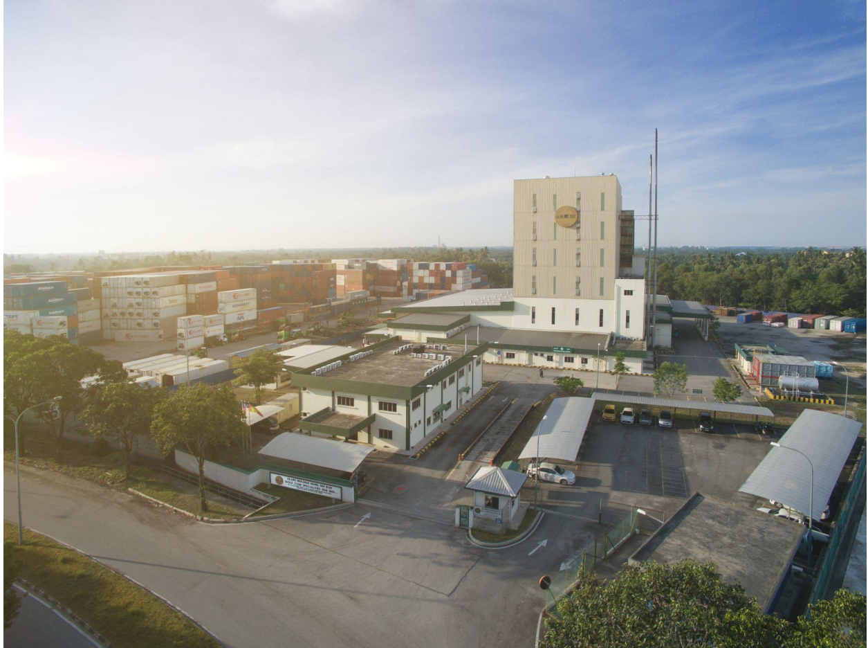
Gold Coin is present in eight countries in the Asia Pacific region, with over 20 production facilities. In photo: Gold Coin Fish Feed Line in West Port, Malaysia.

Pilmico and Gold Coin, the food and agribusiness subsidiary of the Aboitiz Group, will be allocating almost Php 5 billion for CAPEX this year, mainly for its international feed mill expansions in Long An, Vietnam and Yunnan, China.