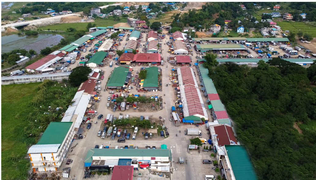
NVAT is a major vegetable trading hub in Region 2.