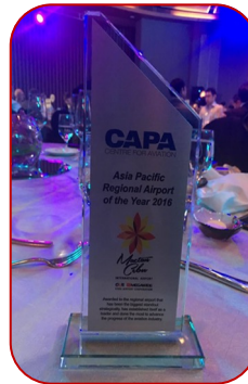
Asia Pacific Regional Airport of the Year 2016