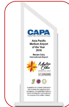
Asia Pacific Medium Airport of the Year 2018