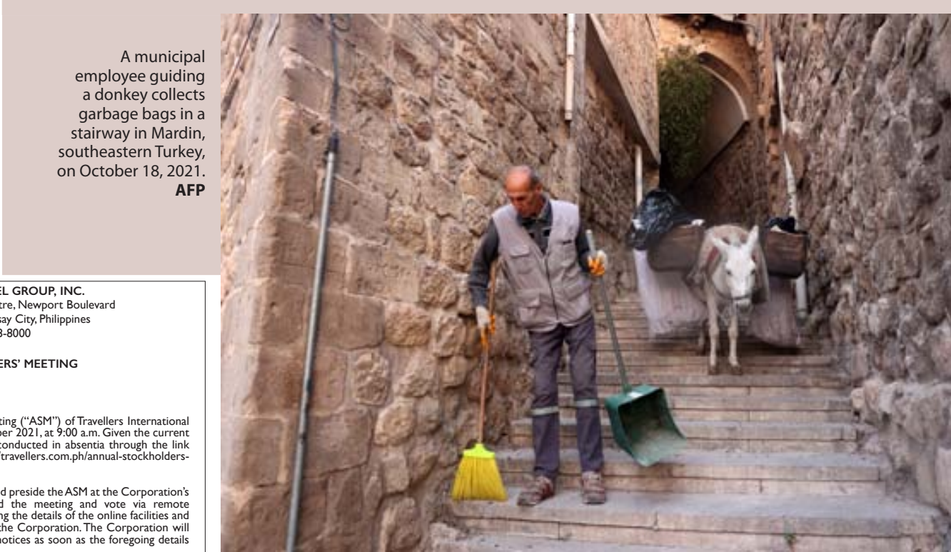
A municipal employee guiding a donkey collects garbage bags in a stairway in Mardin, southeastern Turkey, on October 18, 2021.

By Burcin Gercek MARDIN, Turkey—The sun peeks over the horizon of the medieval Turkish city of Mardin as a herd of cream-colored donkeys begins its day job collecting rubbish before relaxing to classical music in the evenings. Guided by city workers, the animals carry waste bags, winding through the narrow alleys of the city, built on a cliff overlooking what was once Mesopotamia, 60 kilometers (37 miles) from Syria. “We have been using them to clean the city for centuries. They are the only ones who can access these narrow streets,” says Kadri Toparli who works for the Mardin old town cleaning team. “Otherwise, it would be impossible to do this work.” With names like Gaddar (Cruel), Cefo (Indulgent) and Bozo (Pale), reflecting their personalities and features, the forty or so donkeys “have the status of municipal em-