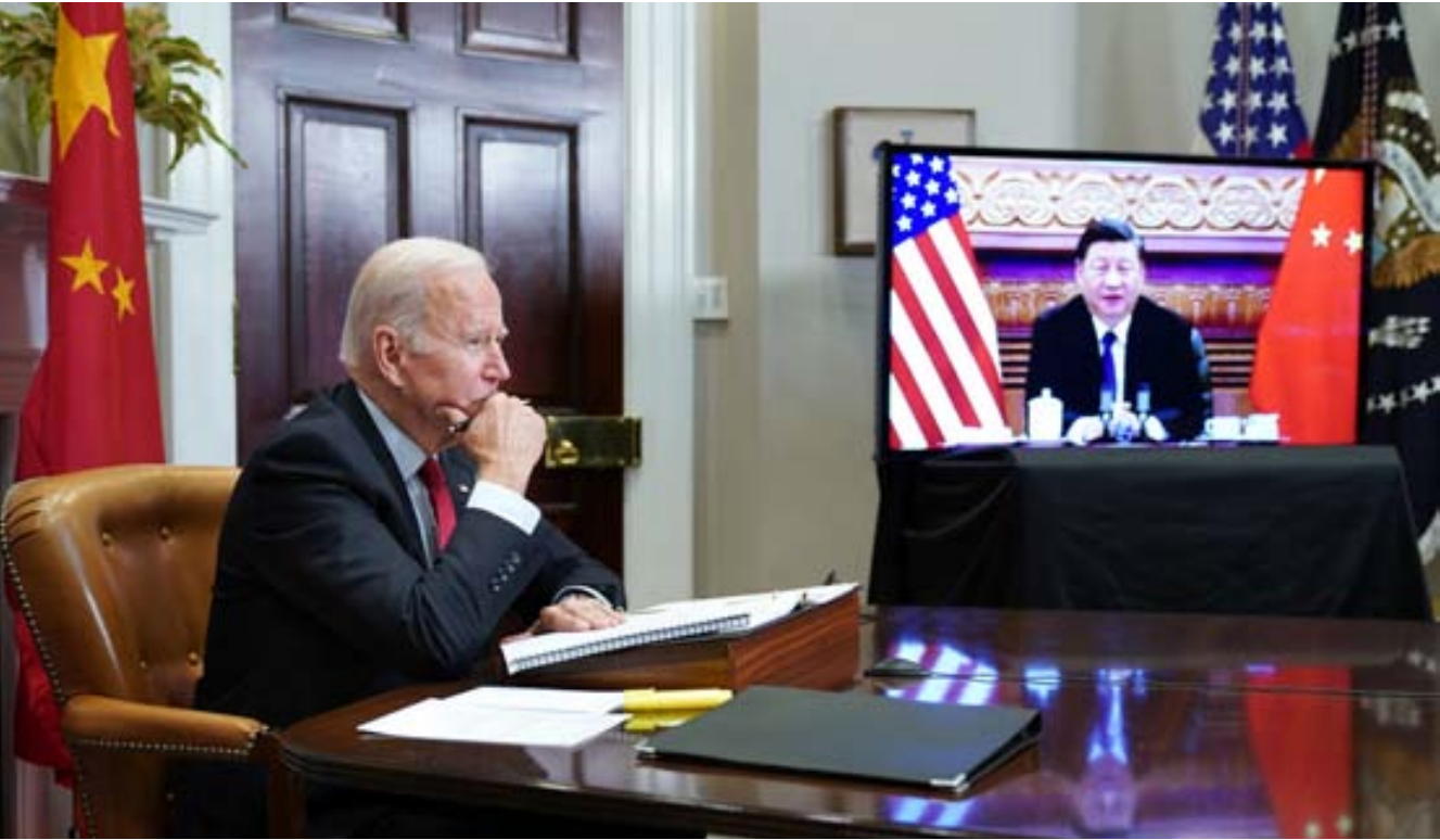
LIVE AND REMOTE. US President Joe Biden meets with China's President Xi Jinping during a virtual summit from the Roosevelt Room of the White House in Washington, DC, November 15.

WASHINGTON -- US President Joe Biden and China's Xi Jinping traded strong warnings on the future of Taiwan at a virtual summit meant to establish "guardrails" against conflict between their rival superpowers.