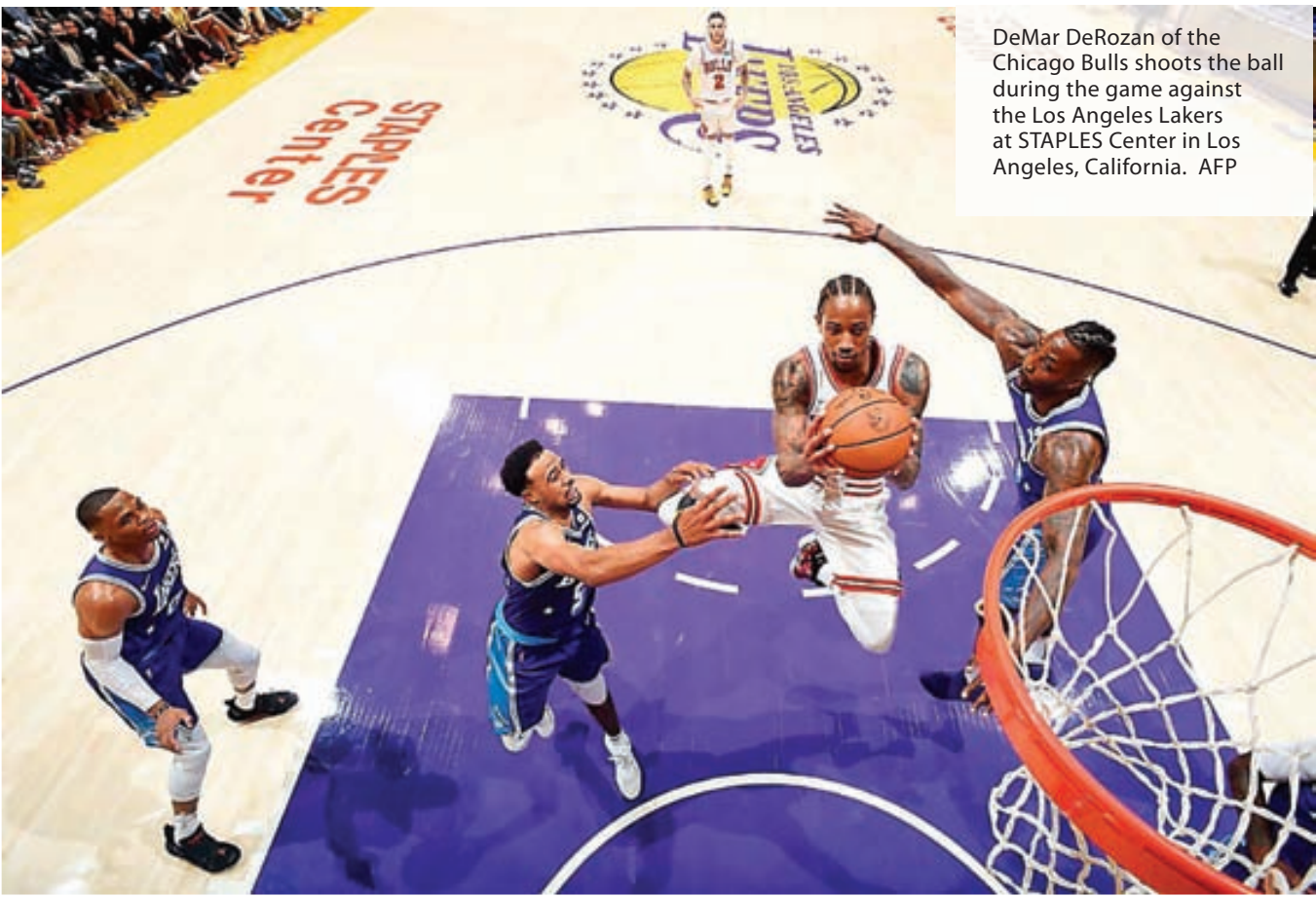
DeMar DeRozan of the Chicago Bulls shoots the ball during the game against the Los Angeles Lakers at STAPLES Center in Los Angeles, California.

Porzingis later told reporters Doncic appeared to be in good spirits in the locker room.