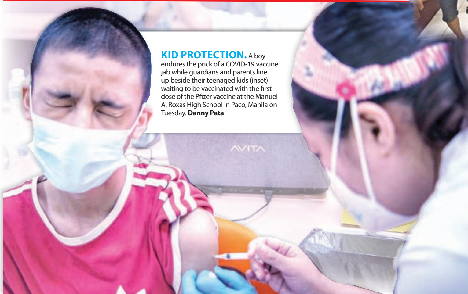
KID PROTECTION. A boy endures the prick of a COVID-19 vaccine jab while guardians and parents line up beside their teenaged kids (inset) waiting to be vaccinated with the first dose of the Pfizer vaccine at the Manuel A. Roxas High School in Paco, Manila on Tuesday.

VOL. XXXV • NO. 275 • 2 SECTIONS 12 PAGES • P18 WEDNESDAY, NOVEMBER 17, 2021 • www.manilastandard.net • mst.daydesk@gmail.com