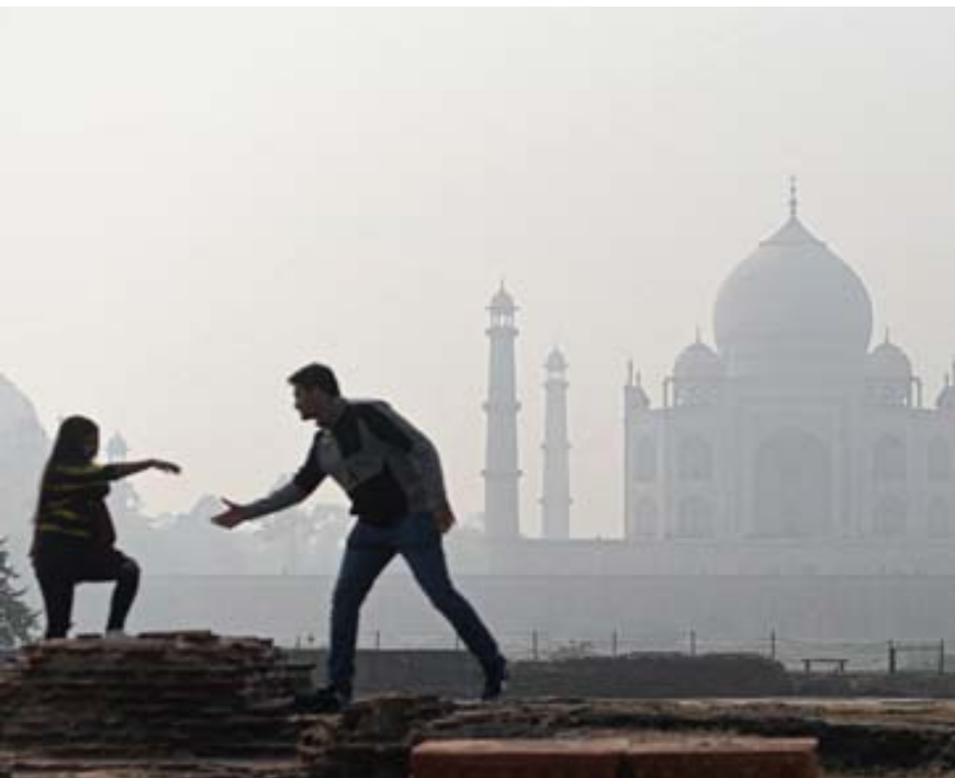
SMOG ALL AROUND. A couple visits the Mehtab Bagh complex behind the Taj Mahal amid smoggy conditions in Agra on November 16. AFP

townsfolk after flooding compromised the local wastewater treatment plant and washed out two bridges. Barricades also went up restricting access to the town. Farnworth said search and rescue crews were dispatched to free people trapped for hours without food or water in 80 to 100 cars on Highway 7. "Many people have been rescued by helicopters from mudslides near Agassiz and Hope with crews working to rescue the remaining people in the next few hours," he said. Those trapped in 50 vehicles in the Lillooet mudslide have all been rescued, while efforts were underway to free an unspecified number of people at the Haig site, he added. AFP