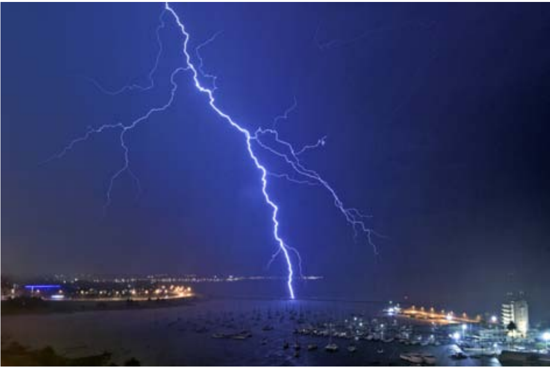
BLUE BOLT. A lightning bolt strikes near the Uruguayan Yacht Club during a thunderstorm in Montevideo early on November 16.

GUAYAQUIL—Ecuador is "seriously threatened" by drug trafficking mafias who want to "take control of all the country's prisons," President Guillermo Lasso said Monday, after the heads of the armed forces and the prison service quit following jail riots that left 68 people dead. Lasso said a "massive operation" was underway by the police and the army in the overcrowded prison in Guayaquil, where two days of fighting between inmates armed with guns, machetes and explosives claimed dozens of lives. The president said the country faced "one of the biggest crises in recent decades" and warned that the same drugs mafias "were bringing insecurity to our streets." He promised joint action to end the