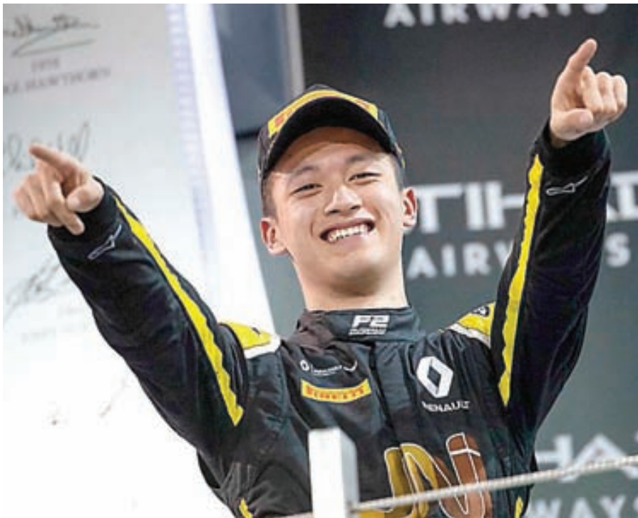
Chinese driver Zhou Guanyu reacts after taking third place at a feature race during the 12th and final round of the 2019 FIA Formula 2 championship at the Yas Marina Circuit in Abu Dhabi, United Arab Emirates.