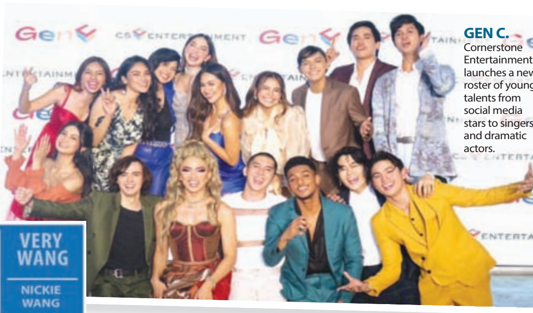
GEN C. Cornerstone Entertainment launches a new roster of young talents from social media stars to singers and dramatic actors.