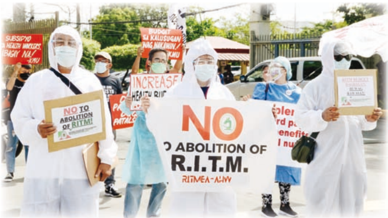
MASKED PROTEST. Health workers wearing full personal protective equipment protest in front of the Senate building in Pasay City on Tuesday to demand a higher health budget and salary increases from lawmakers. Norman Cruz

the IATF (Inter-Agency Task Force for the Management of Emerging Infectious Diseases), which was also approved by the Palace, wearing of face shields in areas, where Alerts Level 1, 2 and 3 are in place, is no longer mandatory. It will be voluntary," Tuazon said. Next page