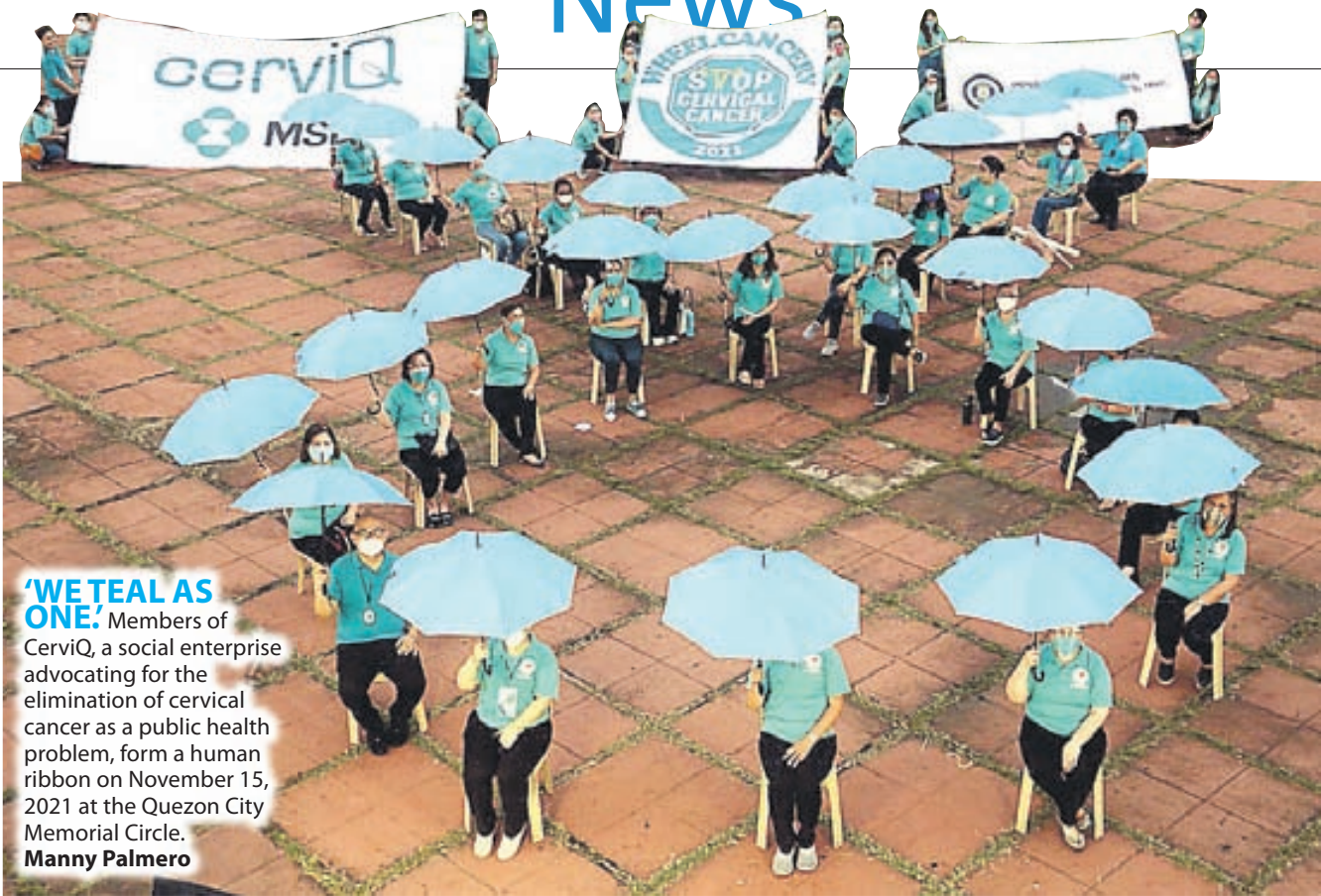
‘WE TEAL AS ONE.’ Members of CerviQ, a social enterprise advocating for the elimination of cervical cancer as a public health problem, form a human ribbon on November 15, 2021 at the Quezon City Memorial Circle.

THE House of Representatives under Speaker Lord Allan Velasco on Tuesday shrugged off reports of a possible change of leadership at the chamber as it remains focused on passing pieces of legislation that will uplift the lives of the Filipino people amid the pandemic. “I don’t know where all these talks are coming from,” House Majority Leader Martin Romualdez said. “Such an idea has not even crossed my mind. These coup rumors have been going on since 2019 and to this day, there has been no evidence of one being hatched,” said Romualdez, who chairs the House Committee on Rules and is president of the Lakas-Christian Muslim Democrats (Lakas-CMD). He also appealed “to everyone to stop all speculations on a change of leadership at the House of Representatives at this time.” “I have no intention to effect any leadership change, especially the speakership. I am a man of honor, and I fully abide with the gentlemen’s agreement forged in the presence of President Duterte in 2019,” he said. “I remain committed to performing everything that needs to be done as the Majority Leader in the plenary in order to pass meaningful laws for the Filipino people until the last day of the 18th Congress,” Romualdez added.