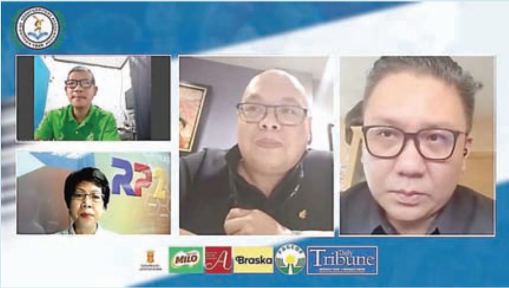
PSA moderators with proponents of the Collegiate Center for Esports Mobile Legends Varsity Cup

The CCE is also awaiting clearance from the