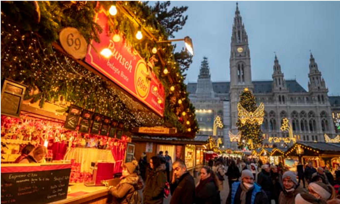
CHRISTMAS LOCKDOWN. Visitors wait for hot drinks at the traditional annual Christmas Market outside of Vienna's city hall in Vienna, Austria on November 15, 2021. Authorities began vaccinating children between 5 and 11 against coronavirus in the capital on November 15, 2021, among soaring rates that saw a countrywide lockdown for some two million people who have not been fully vaccinated against COVID-19.