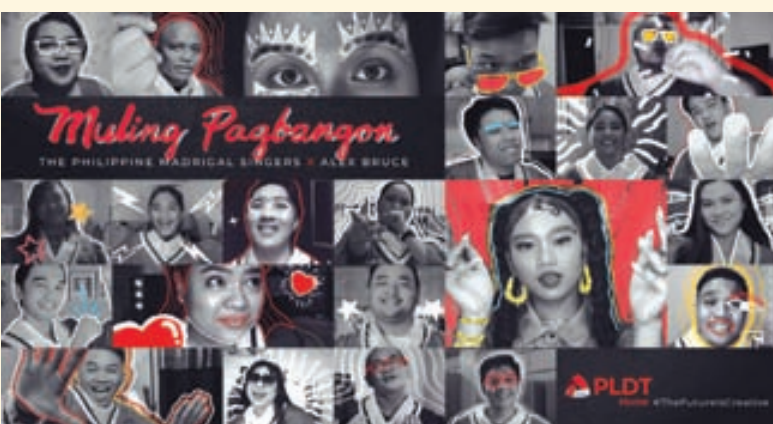
PLDT Home expresses its support for the country’s creative industry, following a heavy blow during this pandemic, via #TheFuturesCreative campaign.

CREATIVE talent is the very fiber of Filipino culture, which ultimately also fuels the engine of Philippine economic growth. Following the pandemic’s heavy blow to the country’s creative industry, telco leader PLDT Home is expressing support for the sector’s recovery through its “The Future is Creative” campaign.